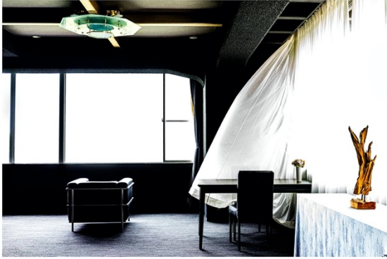
What fog looks like flooding through open windows (in Japan), 2015 28 x 42 in pigment print on 30 x 44 in. paper Edition of 3