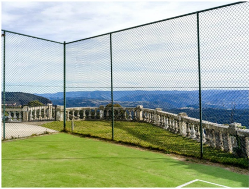
You probably cannot trust people near the edge, 2019 31.5 x 42 in. pigment print on 35.5 x 44 in. paper Edition of 3