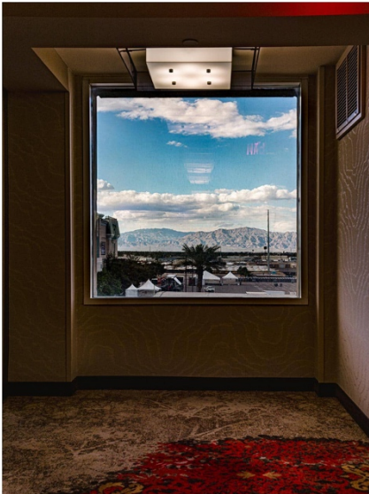
I doubt the EXIT will work, 2020 42 x 31.5 in. pigment print on 44 x 35 in. paper Edition of 3