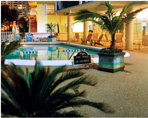
Obviously, the Sealord pool is closed. 2004 33.6 x 42 in pigment print on 35.6 x 44 in. paper Edition of 3