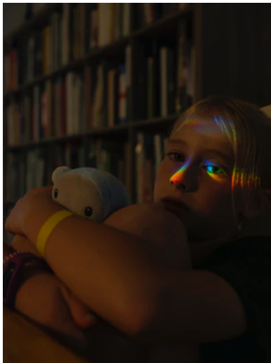
Matt Eich Meira Rainbow, Charlottesville, Virginia, 2021 40 x 30 in. print | 42 x 32 in. framed $5,200 framed