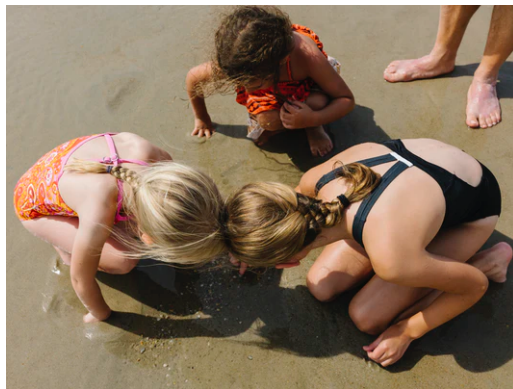
Matt Eich Untitled, Ocracoke Island, North Carolina, 2018 30 x 40 in. print | 32 x 42 in. framed $5,200 framed