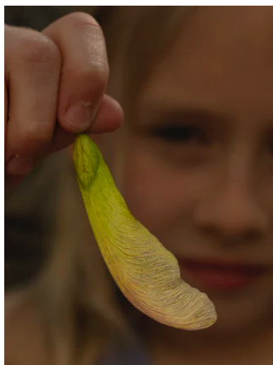
Matt Eich Untitled (Whirligig), Charlottesville, Virginia, 2019 25 x 18.75 in. print | 27 x 20.75 in. framed $3,600 framed