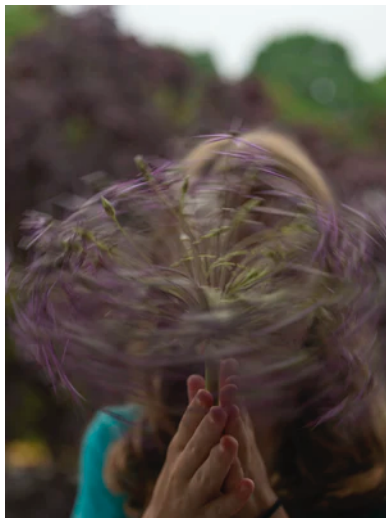
Matt Eich Maddie Twirling Flowers, Charlottesville, Virginia, 2019 25 x 18.75 in. print | 27 x 20.75 in. framed $3,600 framed