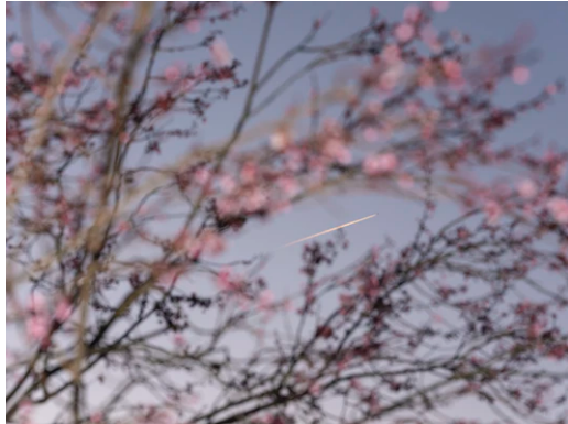
Matt Eich Untitled (Ascent), Charlottesville, Virginia, 2019 30 x 40 in. print | 32 x 42 in. framed $5,200 framed