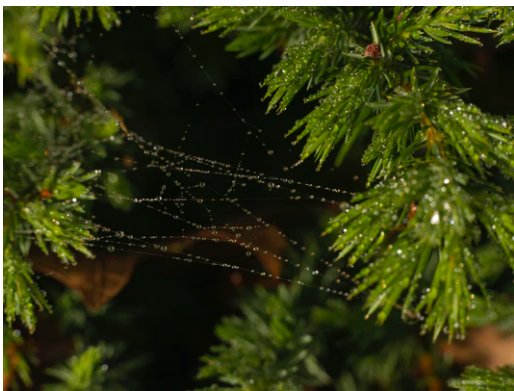
Untitled (Web), Charlottesville, Virginia, 2020 18.75 x 25 in. print | 20.75 x 27 in. framed $3,600 framed