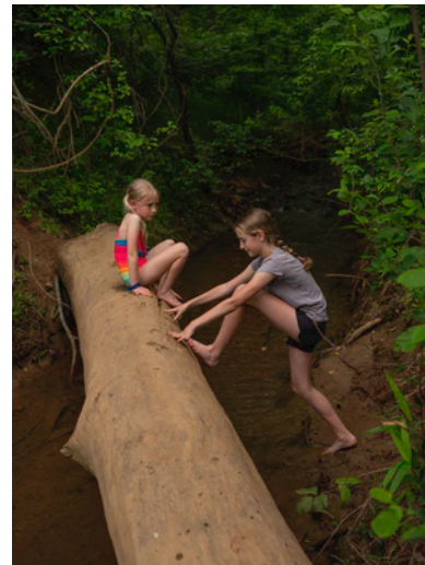
Matt Eich Sisters at the Rivanna, Charlottesville, Virginia, 2020 50 x 37.5 print | 52 x 39.5 in. framed $7,000 framed