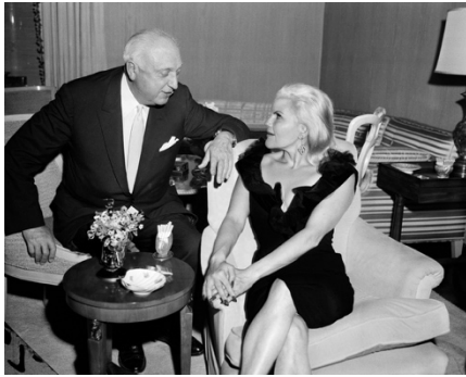
A girl as pretty as you doesn't need any words at all. 2018

Archival ink on paper 24 x 30 in. print | 34 x 28 in. paper Edition 2/3