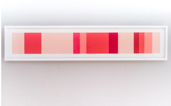
By special appointment to her Majesty . . . The American Woman, 2019

Archival ink on paper 13.5 x 61.5x 3 in. Edition of 1 +1AP