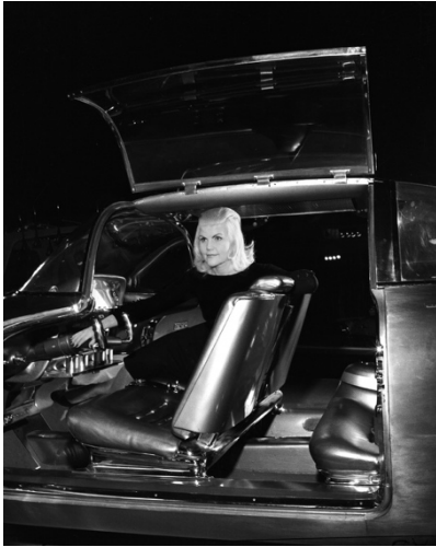
I met the man of my future my future modeling in the Car of Tomorrow, 2018

Archival ink on paper 40 x 50 print | 44 x 54 paper Edition #2/3