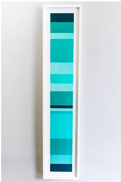
Living now is happier and very much easier for womanhood, 2019

Archival ink on paper 61.5 x 13.5 x 3 in. Edition of 1 +1AP