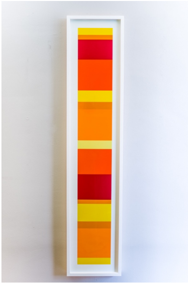
Ecology through consumerism, 2019

Archival ink on paper 61.5 x 13.5 x 3 in. Edition of 1 +1AP