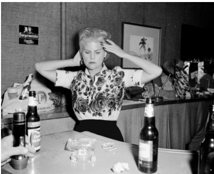
I was a vendor of drink but not of love, 2018

Archival ink on paper 24 x 30 in. print | 34 x 28 in. paper Edition 2/3